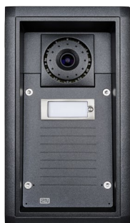
2N® Helios IP Force