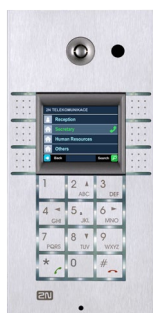
2N® Helios IP Vario