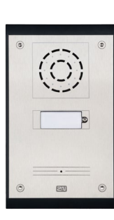
2N® Helios IP Uni

The 2N® Helios IP family is a wide range of door intercoms for every situation - whether in security, business, emergency, or any other special area.