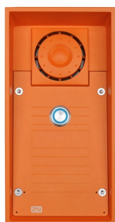
2N® Helios IP Safety